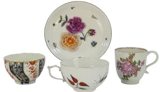
Lot 222 - A late 18th century Meissen tea cup