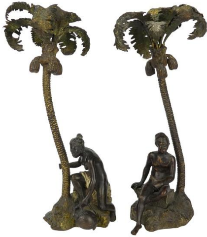
Lot 48 - In the manner of Franz Bergman cold painted bronzes