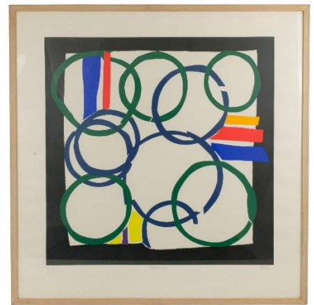
Lot 776 - Sandra BLOW Borderline Screen print