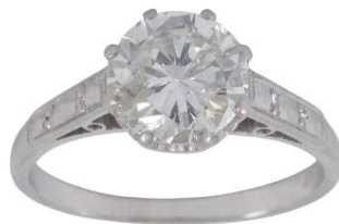
Lot 649 - A platinum set solitaire diamond ring