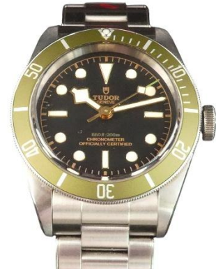
Lot 706 - Tudor Black Bay 'Harrods' automatic wristwatch