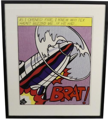
Lot 834 - Roy LICHTENSTEIN - As I Opened Fire... Serigraph