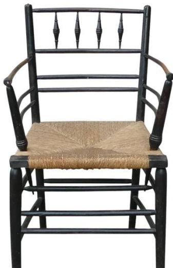
Lot 933 - Sussex armchair in the manner of Morris & Co