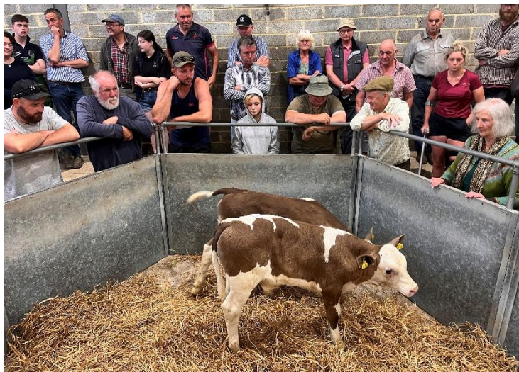
“4 week old Simmental x bull calf to £705 for Messrs L W & S Hosken of Helston”

British Blue x to £695 x 2 for Messrs N J Cox & H Floyd of Tregony, Truro