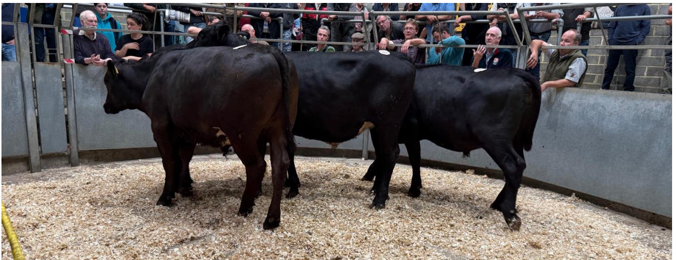
“Messrs J H Pellow & Sons of Carnhell Green, Camborne sold four 17 month old Angus steers to £1700”