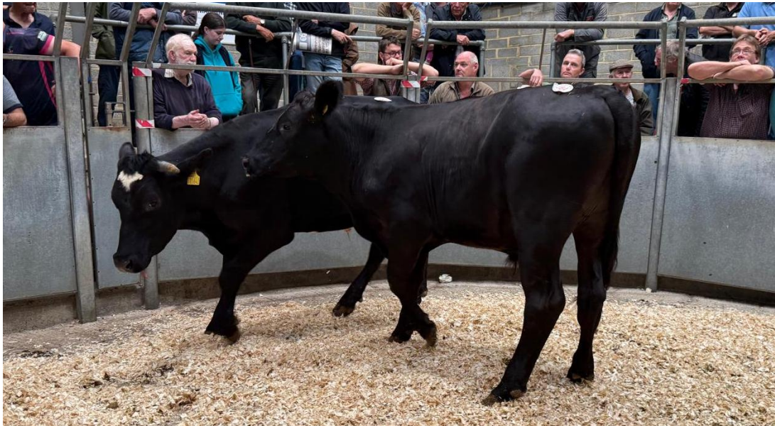
“A pair of 22 month old Angus steers on behalf of R M Farming & Co of Sticker, St Austell at £1870”