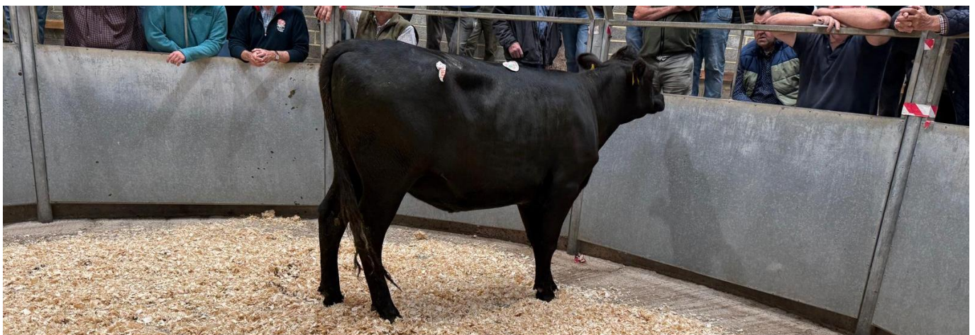
“21 month old Aberdeen Angus x heifer to £1305 for Messrs W S Gay & Son of St Allen, Truro”