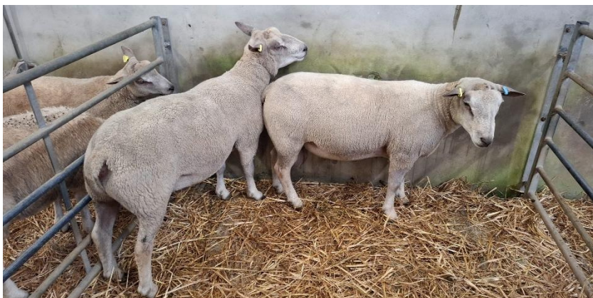
£610 & £510 for CharTex from Messrs W J Hicks & Son of St Merryn, Padstow