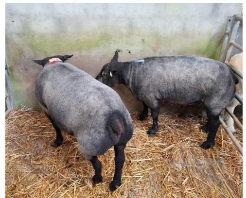
£320 & £280 for Blue Texels from Mrs B Baxter of Porkellis, Helston