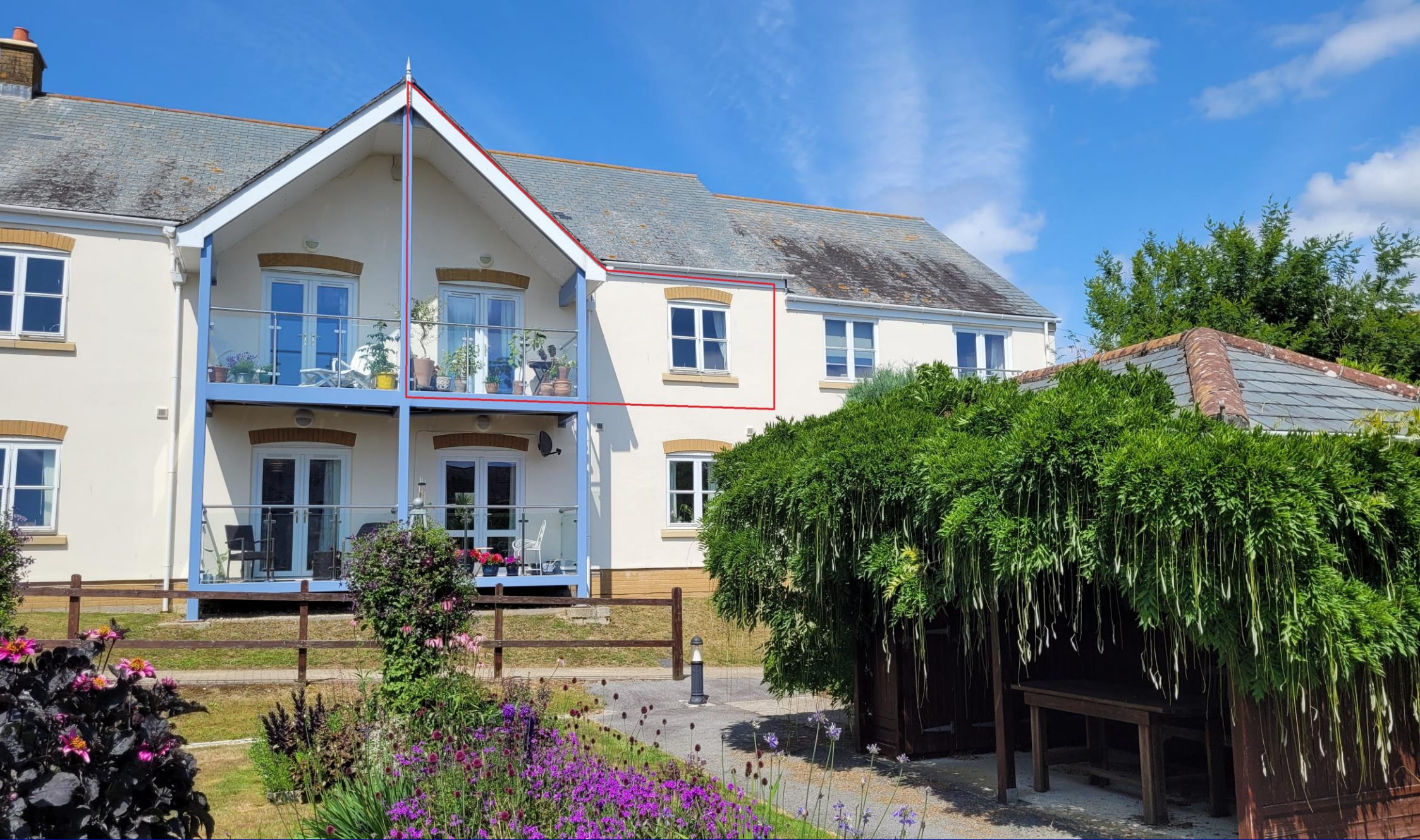
11 Nare House, Roseland Parc, Tregony