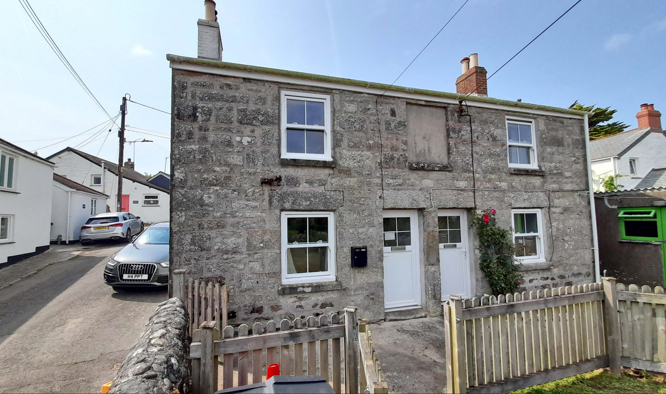
Lynfield Cottage, Perranuthnoe, Penzance