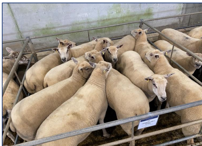
Cracking pen to £230 for Messrs W J Hicks & Son