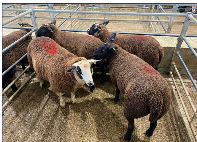
Super single (A) to £192 for Mr K Rogerson