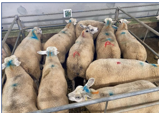
2 lambs (A's) to £194 for James Eustice Farms