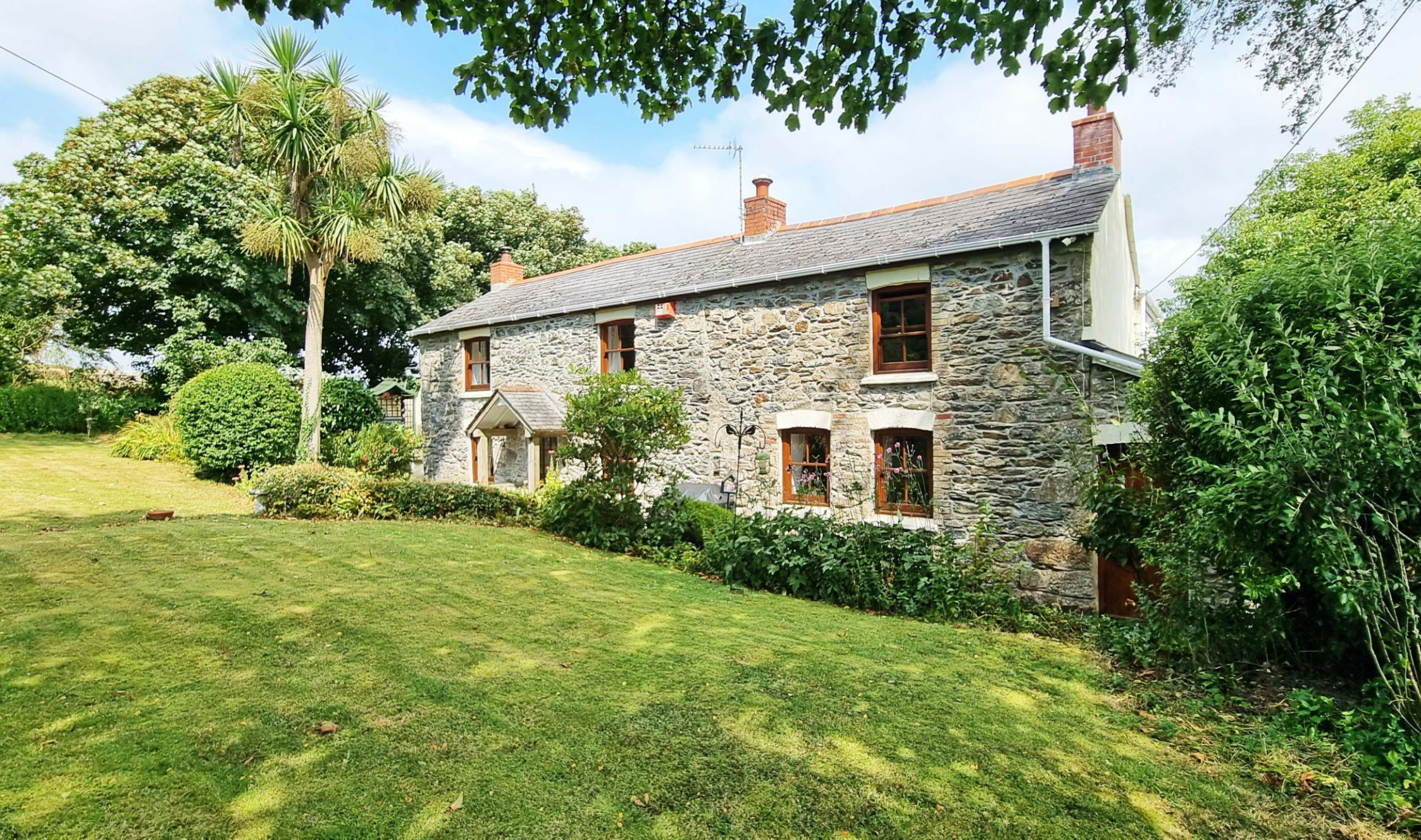
Meadowside Cottage, Wheal Clifford, St Day