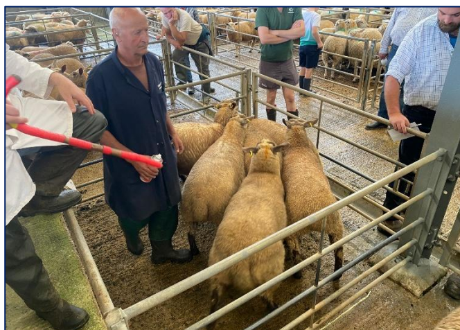
£192.00 for 64.00kg lambs from Messrs H L Banbury & Son of St Ervan, Wadebridge