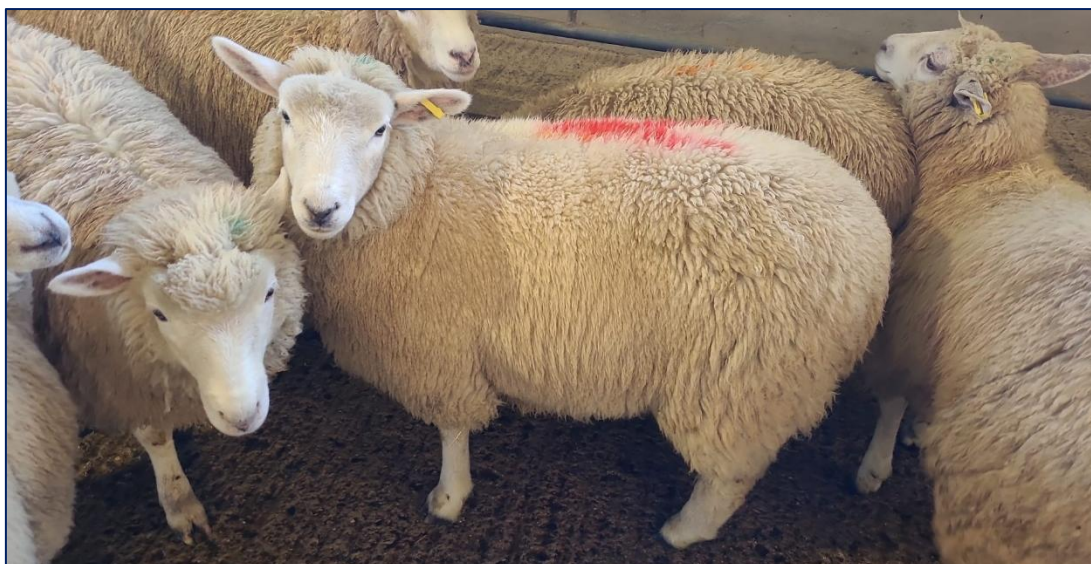
“£138.00 for stores from Mrs P R Sluggett from Grampound Road”

£120.50 for stores from Mrs P R Sluggett of Grampound Road