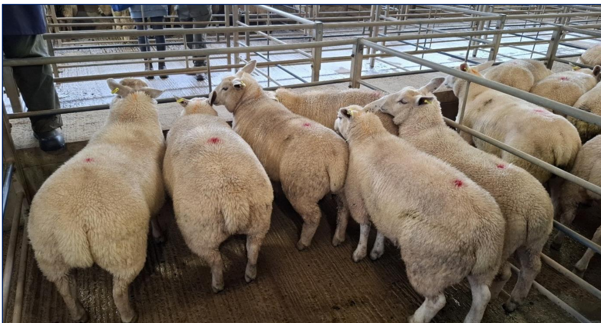
“Smart lambs from Messrs I D & S S Backway of St Eval, Wadebridge”