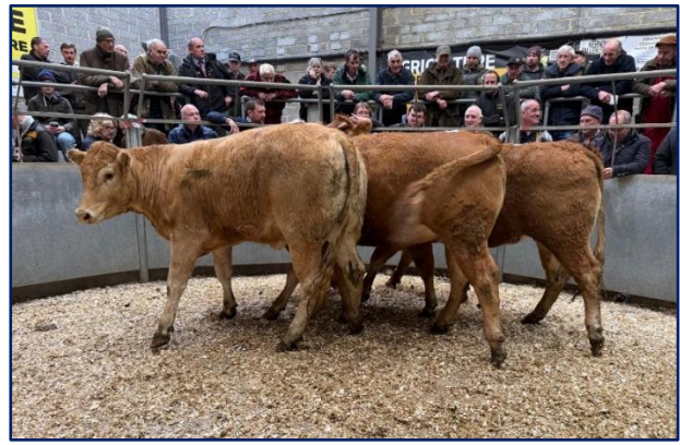
“Top price heifers £2120 for Mr W G Piper of Newtown, Penzance”