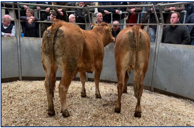
“Top price steer store £2280 for Mr W G Piper of Newtown, Penzance”