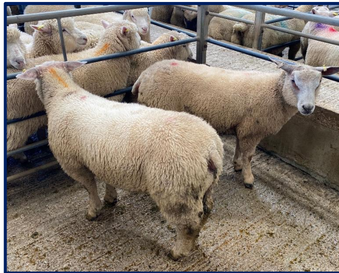
'£199.50 for Miss L Monk of Kerley, Truro'

443.00p/kg av. 428.30p/kg 473.00p/kg av. 425.00p/kg 432.00p/kg av. 412.0p/kg 432.00p/kg