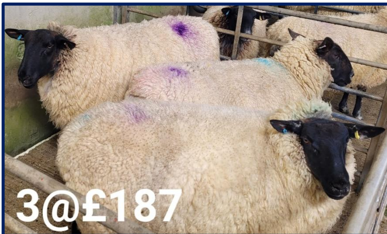
'£187 for Messrs W P L Cowling & Sons of Newquay'