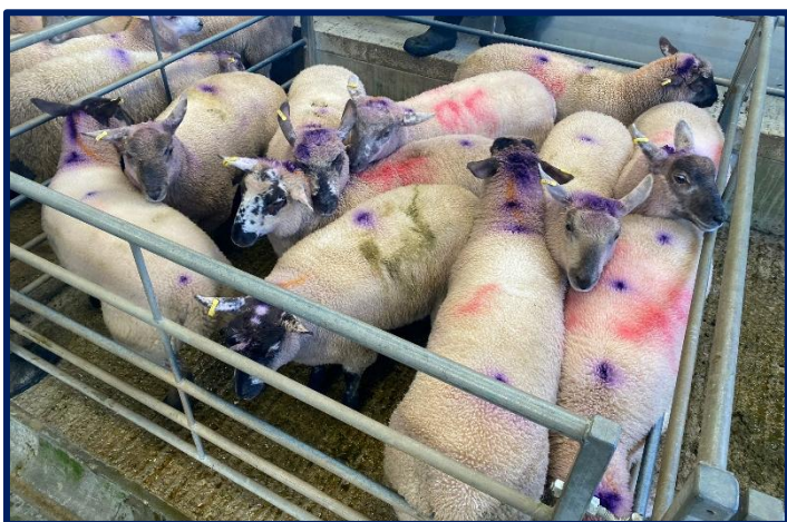
'£199.50 for Messrs WPL Cowling & Sons of Newquay'