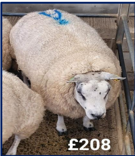
'£208 for Mrs H S Payne Newquay'

Many more could have been sold on the flying trade, please notify your entries in good time for next week. A selection of photographs below with more on our Facebook page