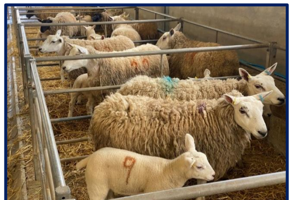
'A smashing consignment of single couples from Mr T Hall of Bodmin'