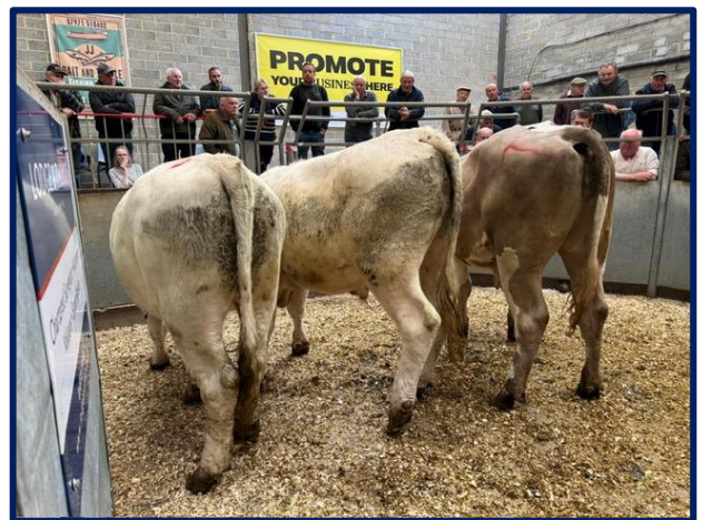
‘Charolais x steers to £2085 for R M Farming Co of Sticker, St Austell’