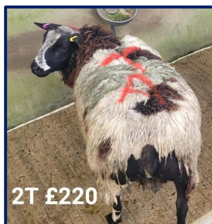
'£220 from Miss L Monk'