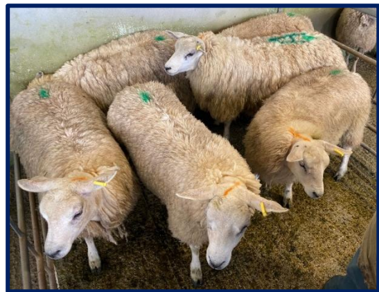
‘£260.00 & £257.00 for hoggs from Messrs T B & M B Osborne’