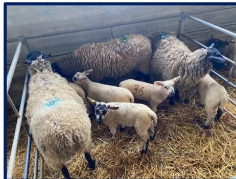
'A super run of couples from Mr T Hall of Bodmin'