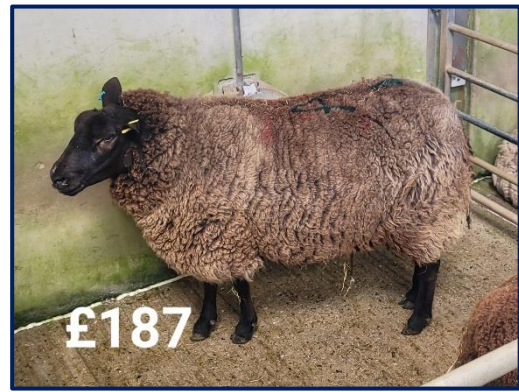
'£187 from Messrs M & S Baxter'