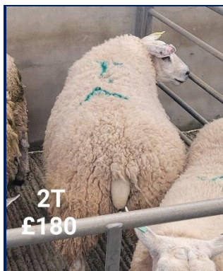
'(2T) from Messrs T B & M B Osborne'

£163.00 for sheep (2T) from Messrs T B & M B Osborne of St Eval, Wadebridge