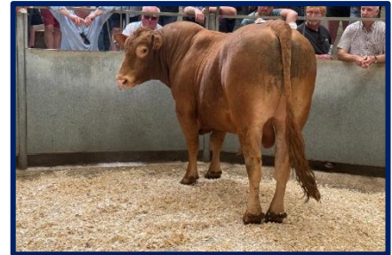
'South Devon Bull to £2700 for Messrs M C Bone & Son'