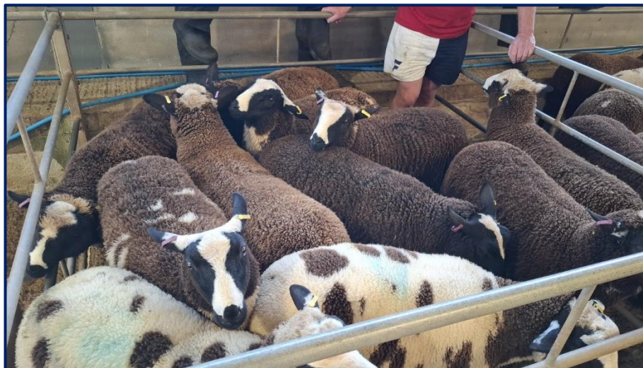
'Dutch Spotted store lambs for Messrs M & S Baxter of Wendron, Helston selling to £135 twice'