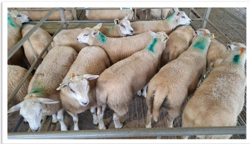
386p/kg & £183.50 for 47.50kg lambs from Messrs C D Greenaway & Sons of St Issey, Wadebridge